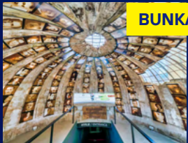
BUNKART 1 & 2

The heart of Tirana and the city's main gathering point. Surrounded by key landmarks including the Et'hem Bey Mosque, the National Opera, and the National History Museum.