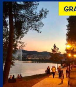
GRAND PARK OF TIRANA

Located just outside the city, Mount Dajti offers panoramic views over Tirana. The Dajti Ekspres cable car provides quick access to restaurants, trails, and outdoor activities.