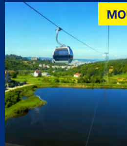
MOUNT DAJTI & THE DAJTI EKSPRES CABLE CAR

Tirana's most vibrant neighbourhood, known for its cafés, restaurants, boutiques, and nightlife. Ideal for dining or an evening walk after conference sessions.