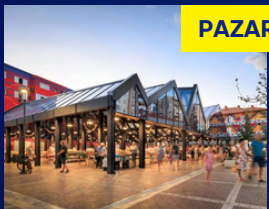
PAZARI I RI — THE NEW BAZAAR

One of Tirana's most iconic landmarks, recently transformed into the TUMO Center for Creative Technologies, a hub for youth innovation and digital learning.