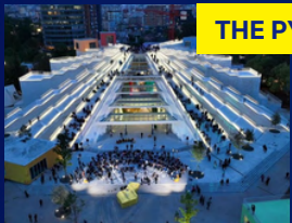
THE PYRAMID OF TIRANA

Two former Cold War bunkers transformed into museums exploring Albania's communist past. Bunk'Art 2, located in the city centre, is the most accessible for visitors.